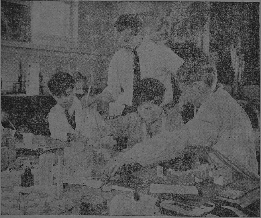
Here an art class is seen in progress.