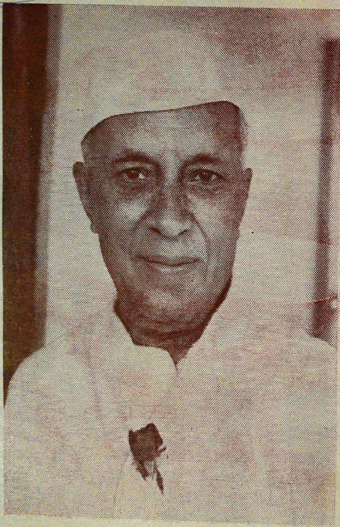
A TEACHER OF TEACHERS