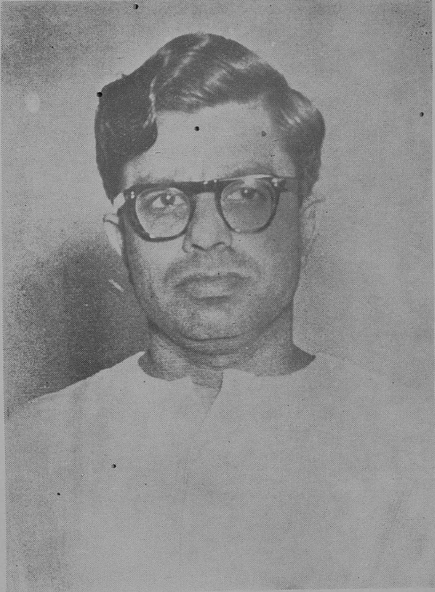
SRI C. SUBRAMANIAM, Minister for Education and Finance, Government of Madras. who Inaugurates the 44th Madras State Educational Conference, Tanjore.