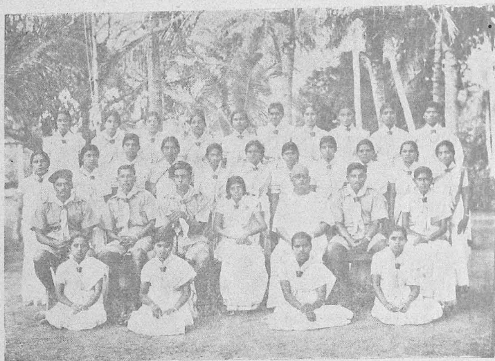
Muthugapatty, Namakkal Salem Dt.