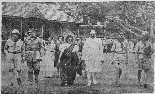
H. E. SRI PRAKASA ARRIVES AT THE RALLY GROUND.

The function came to a close with the singing of the National Anthem.