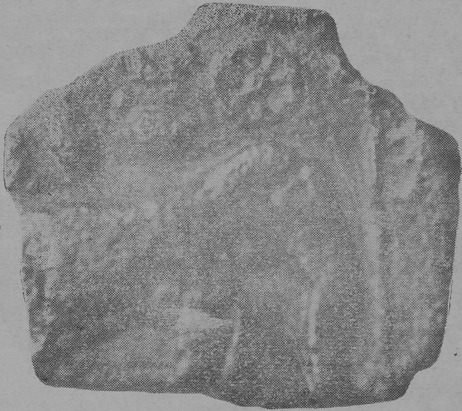
Pandya square copper coin, Sangam age, Alagankulam, Ramanathapuram District, 4th century B.C.