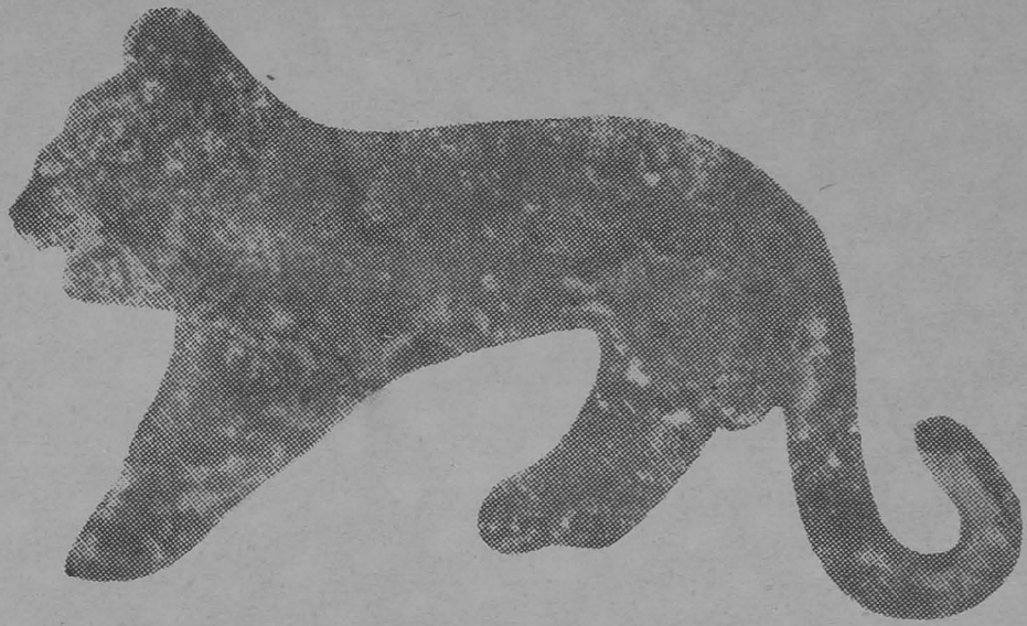
Bronze tiger studded with semi-precious stones, Kodumanal, Periyar District, 3rd century B.C, ( Courtesy, Tamil University, Thanjavur )