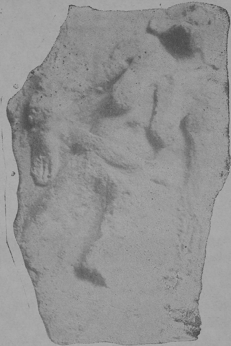
Figure of Mother Goddess (Mūthōḷ), applique found on the exterior of an urn, Melapperumpallam, near Pumpuhar, Nagappattinam District, 3rd century A.D.