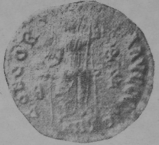
Coin of Valentinian II, King of Rome, Alagankulam, Ramanathapuram District, 4th century A.D.