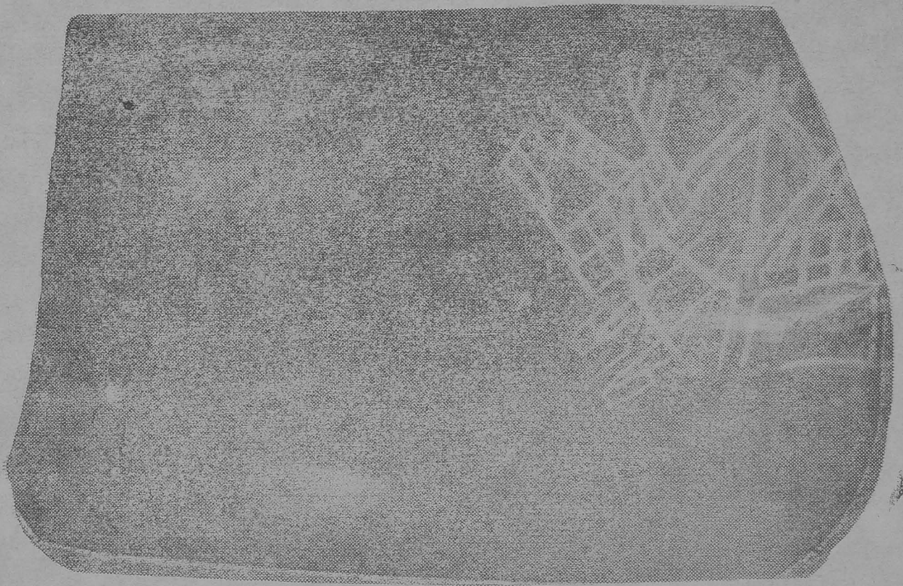
Sherd with ship graffiti, Alagankulam, Ramanathapuram District, 2nd century B.C. to 2nd century A.D.