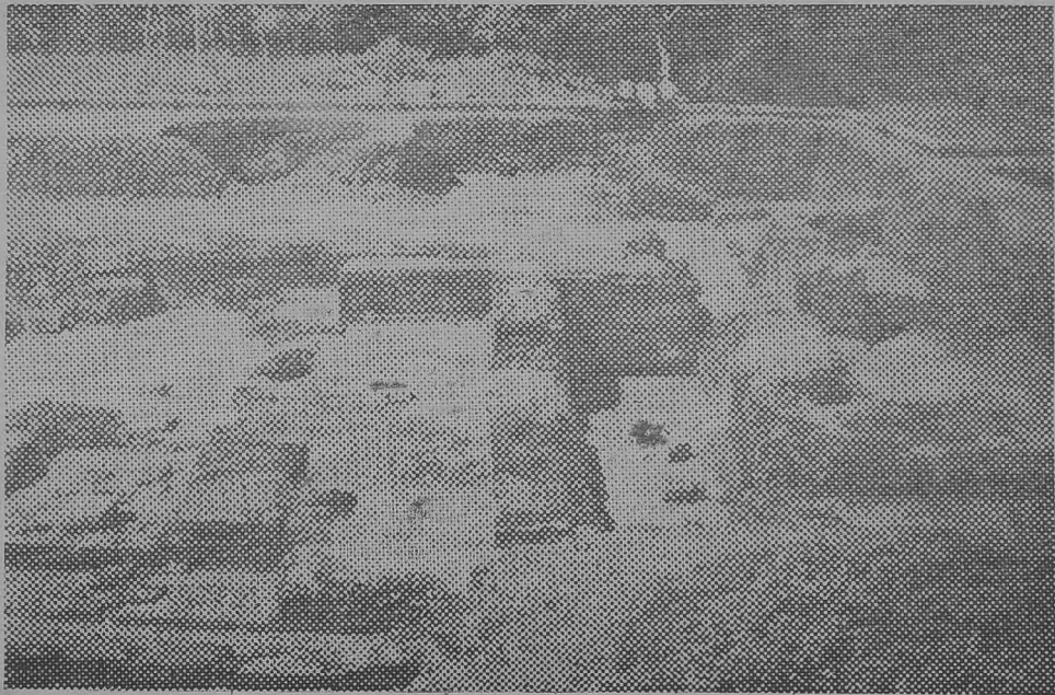
Foundation of the palace of Rajendra Chola, Gangaikondacholapuram, Perambalur District, 11th century A.D.