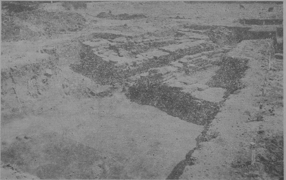
Wharf, Pumpuhar, Nagappattinam District, 3rd century B.C.