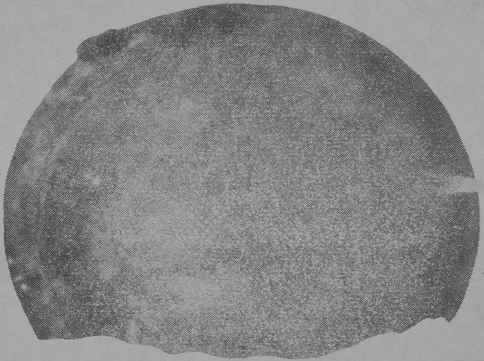
Decorated bowl, copper, unearthed from a cairn circle, Kodumanal, Periyar District, 3rd century B.C.