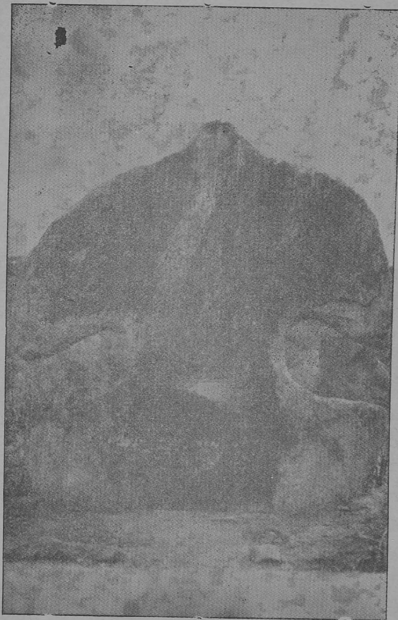
Mother Goddess (Mūthō!), erected at the centre of a cairn circle, Udaiyanattam, Villupuram District, 1000 B.C. to 500 B.C.