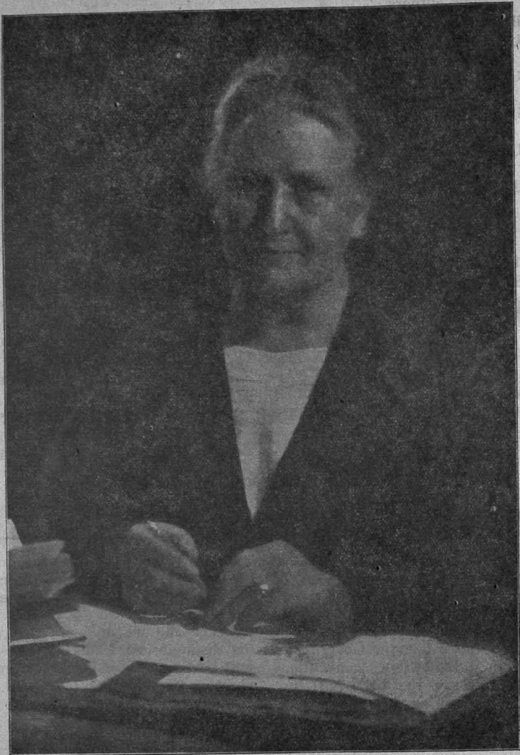
The late Dr. MARIA MONTESSORI