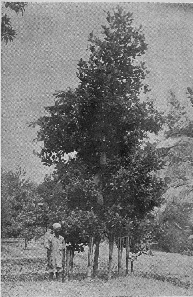
"SINGAPORE JACK" in bearing Planted in December 1947. Flowered in December 1950 and fruited.